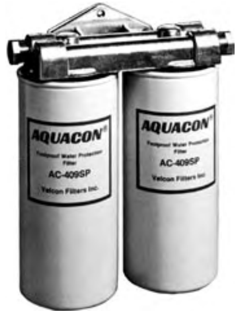
Two AC-409SP Cartridges mounted to SPH-5 Parallel Flow Head