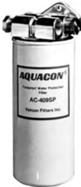
AC-409SP mounted to SPH-4 Head