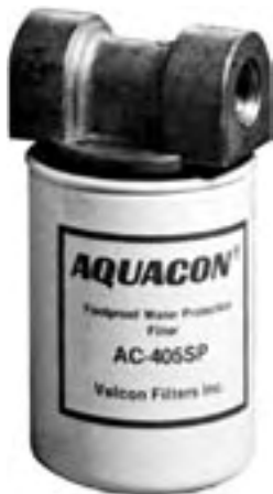
AC-405SP mounted to SPH-2 Head