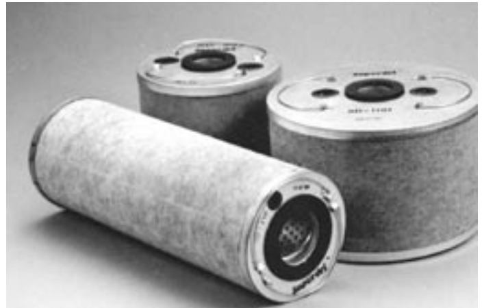
Models SD-718, SD-807, and SD-1107, respectively.

Superdri cartridges are not designed for particulate removal. Prefiltering through Velcon 1/2 micron elements is recommended if particle contamination is suspected. Superdri cartridges are not recommended for cost effective removal of free water in insulating oil. If free water is suspected, the oil should be prefiltered using Velcon Aquacon ® elements.