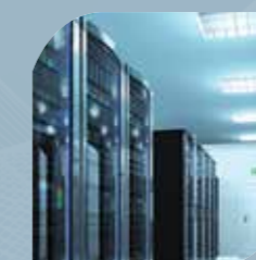
DATA CENTRE FUEL TESTING