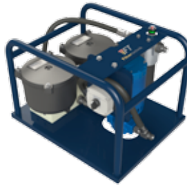
Twin Hippo Filter with SRLT option - BD5000