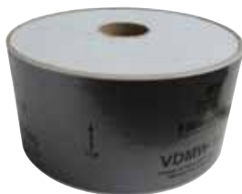
VDMW Element - Part code: VDMW-180