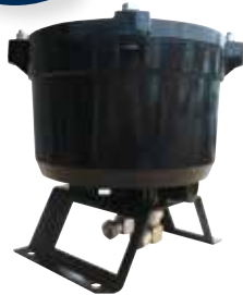
Hippo Filter - FTP 180