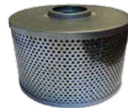
Pleated Element: Part code: MM4627-A1