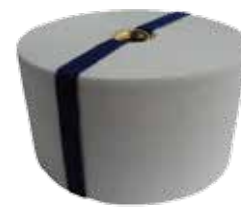
Polypropelene Element: part code: SDFC (W2P)