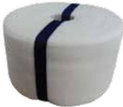
Cellulose Element: part code: SDFC (W2) Disc