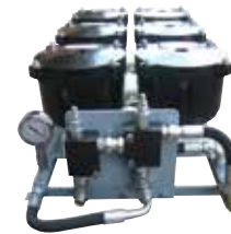
6 Hippo Configuration FTP-180-6