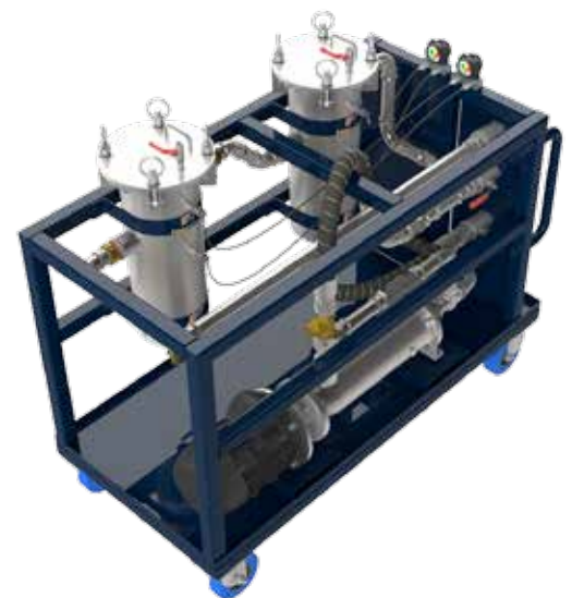
NDU-3NX: 50L/min (3,000L/hr)

Capable of dehydrating 1,000 Litres of oil in 60 minutes*