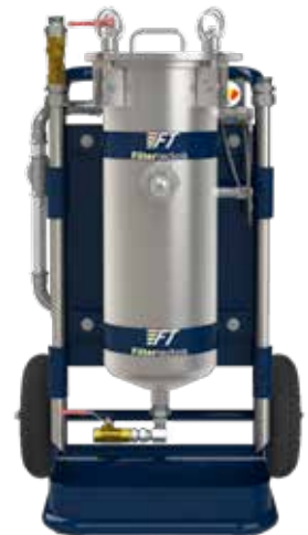
NDU-INX: 15L/min (900L/hr)

Capable of dehydrating 1,000 Litres of oil in 200 minutes*